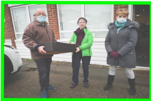
Donation from The Hill School, Emmer Green

This ongoing new role has led to us re-instating the name " Stepping Stones " which was our housing project until a few years ago. Though we can't any longer actually house people we can assist and support them into housing.